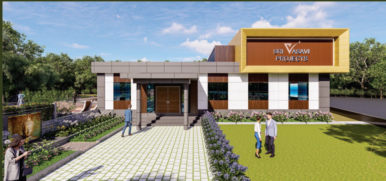
5000 sft. Clubhouse

Every element here is shaped with intent, from infrastructure to leisure. Approvals secured and features aligned make the offering whole. A clubhouse creates space for gathering, while a swimming pool brings relaxation into everyday life. Roads, parks, and gardens extend the rhythm of living. This is a layout designed for belonging, movement, and assurance, a place where life feels complete.